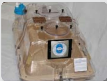
Figure 1: Domed Cover

†Please Note: prices do not include shipping