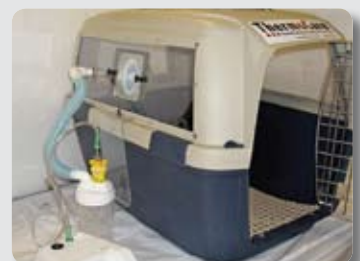
Figure 4: Unheated Unit

No Motor Fans • Easily Cleaned w/ any Disinfectant • Easy Setup & Operation Economical • Stand-alone Chamber (Mobile Vets, Emergency Transport)