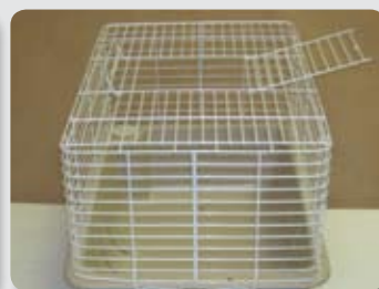
Figure 3: Cage Cover